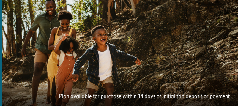
Plan available for purchase within 14 days of initial trip deposit or payment

Whether you're planning a solo adventure or a grand, multi-generational getaway, the whole point is to relax and enjoy your trip. Allianz Travel Insurance gives you the confidence to focus on the experience, knowing you are protected against many common travel mishaps and emergencies by a reputable company with a global network and award-winning customer service.